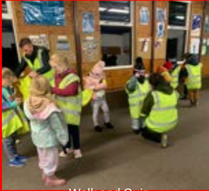
Walk and Quiz

The aim of my report this year is to show through photos what fun we have at beavers and mention a handful of the many many activities we have done this year.