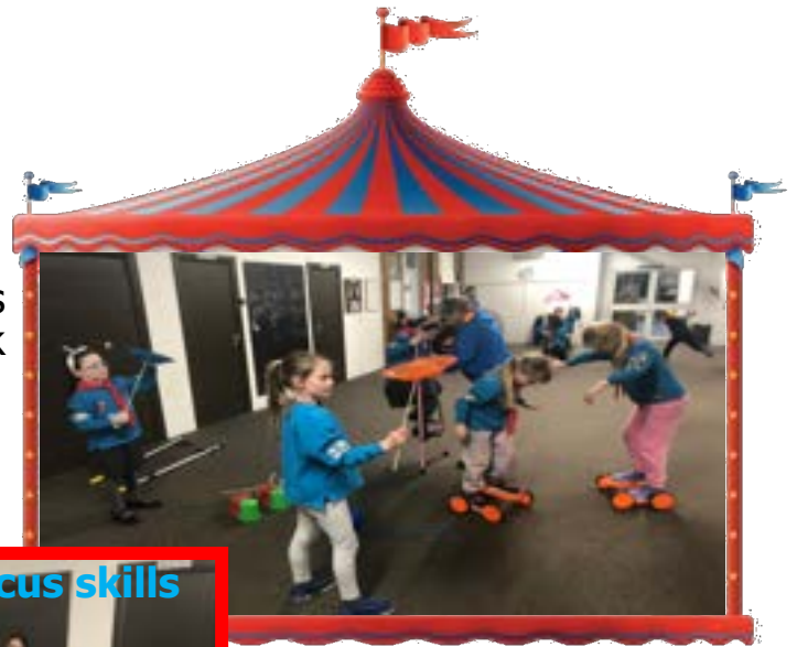
New Circus skills learnt

So many activities completed. So much fun has been had.