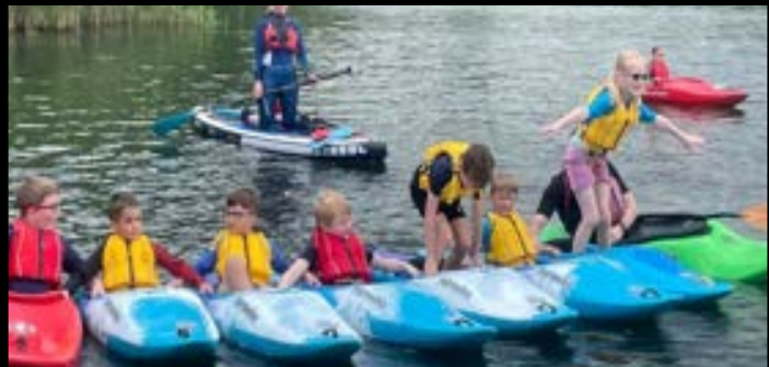
Fun on the water at Southwater