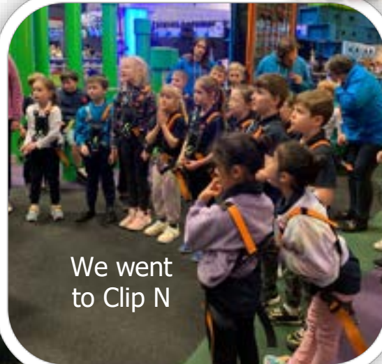
We went to Clip N

We had an amazing time at Go beavers and many new experiences were had there.