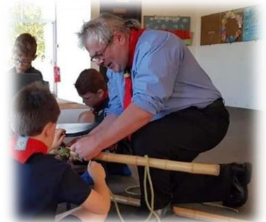
Cub Scout Leader