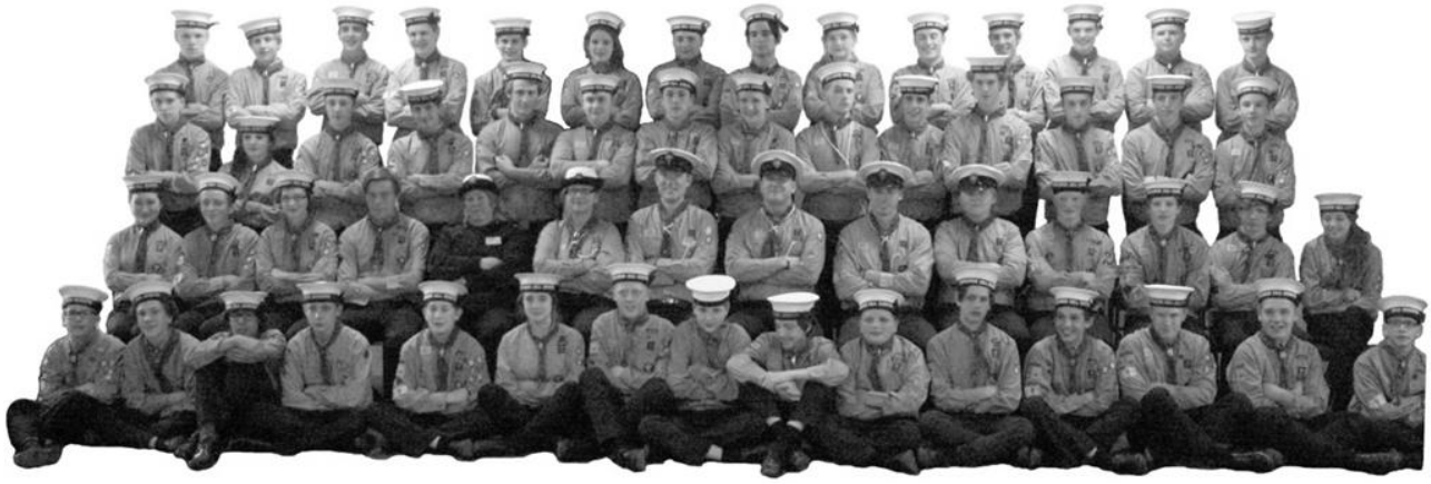
Osprey Explorer Sea Scout Unit - 2nd June 2014

March: We cooked pancakes by candlelight. We tried castaway cooking. We went to the cinema to watch Need For Speed. We had a mobile phone photography competition.